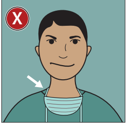
DON'T wear your facemask around your neck.