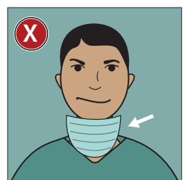
DON'T wear your facemask under your nose or mouth.