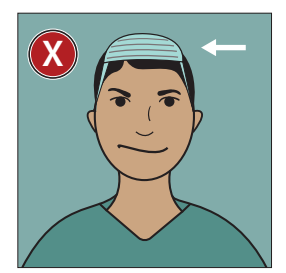
DON'T wear your facemask on your head.