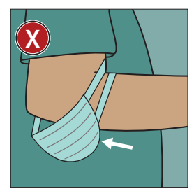
DON'T wear your facemask around your arm.