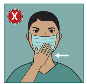
DON'T touch or adjust your facemask without cleaning your hands before and after.