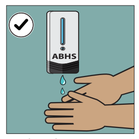
DO leave the patient care area, then clean your hands with alcohol-based hand sanitizer or soap and water.